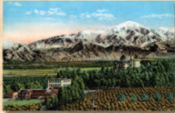
Loma Linda Sanitarium, with Hospital and North Laboratory in foreground.