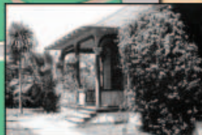
14 One of three original patient cottages still standing.