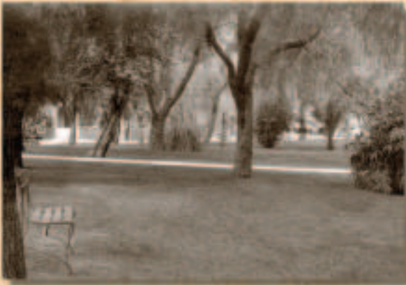
Pepper grove and croquet area on the hill.

The self-guided walking tour begins at the Good Samaritan monument at the center of the campus, and includes seventeen sites as described on the map. It is recommended that time be taken to visit the Heritage Room in the University Library at the beginning of the tour to gain additional information on the history of the University. Hours are 9:00 a.m. to 8:00 p.m. Monday through Thursday, and 9:00 a.m. to 1:00 p.m. on Friday. Phone: (909) 558-4942.