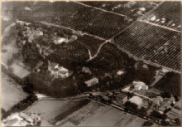
Aerial view of Loma Linda, circa 1920. On the hill are the Sanitarium and cottages, nurses' home, and old chapel. Lower right corner is college campus.