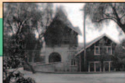
9 Loma Linda Chapel, completed in 1910. Final service in 1937.