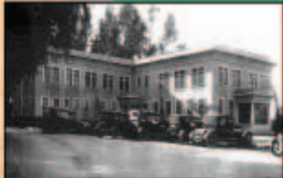
6 Site of South Laboratory, built in 1919.