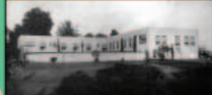
12 Second Loma Linda Hospital, August, 1924. The structure still stands as part of the west end of Nichol Hall.