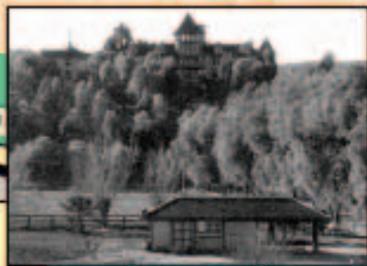
10 Site of Loma Linda Sanitarium, built in 1880s. Previously a hotel. Train Station in foreground of picture.