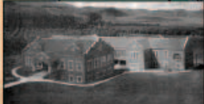
3 Site of first Loma Linda Hospital, dedicated on December 1, 1913.