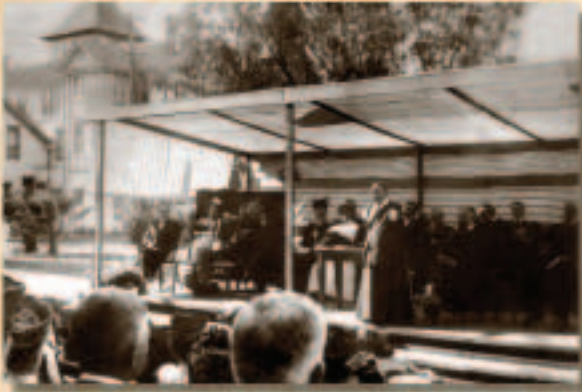
Ellen G. White, speaking at the dedication of Loma Linda Sanitarium, April 15, 1906.