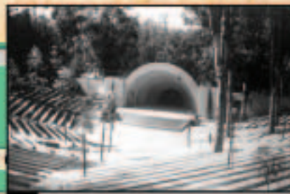
11 Site of Loma Linda Bowl, built in 1924. Used for graduations until 1950.