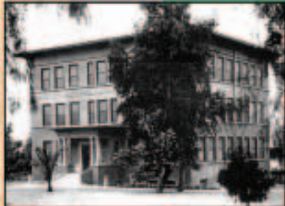
7 Site of North Laboratory, built in 1911.