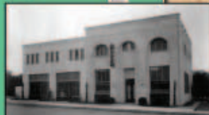
16 First National Bank of Loma Linda, opened October, 1929.